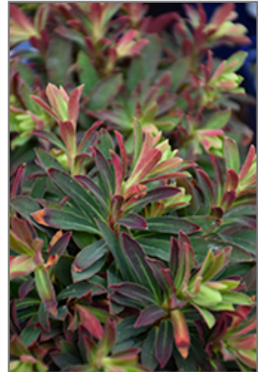
Tiny Tim Spurge flowers