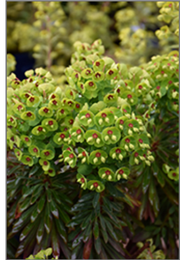
Tiny Tim Spurge flowers