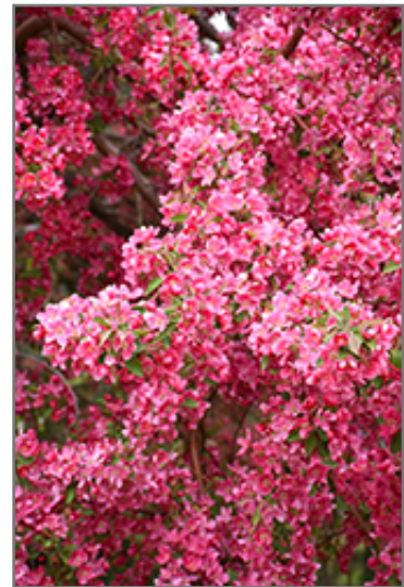
Prairifire Flowering Crab flowers