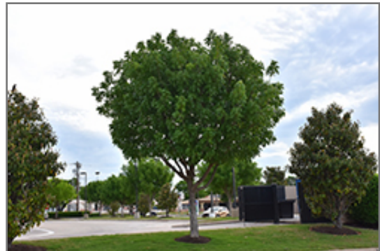
Chinese Pistache