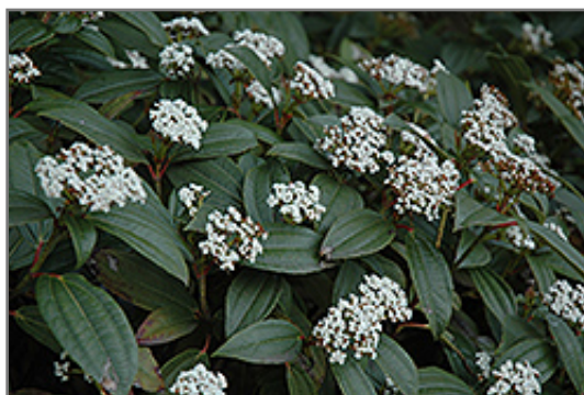
David Viburnum flowers