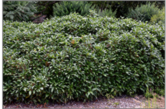
David Viburnum

This shrub does best in partial shade to shade. It prefers to grow in average to moist conditions, and shouldn't be allowed to dry out. It is not particular as to soil type or pH. It is highly tolerant of urban pollution and will even thrive in inner city environments. This species is not originally from North America.