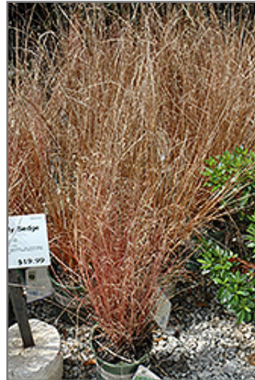
Leatherleaf Sedge