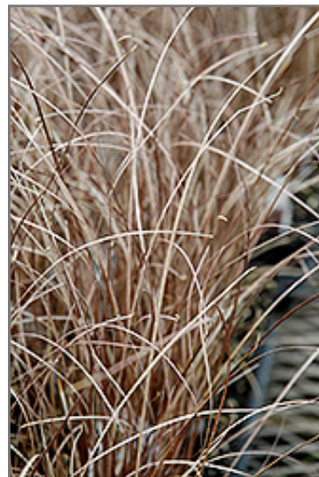
Leatherleaf Sedge foliage