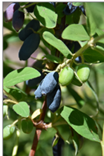
Cinderella Honeyberry fruit

This is a dense multi-stemmed deciduous shrub with a more or less rounded form. Its average texture blends into the landscape, but can be balanced by one or two finer or coarser trees or shrubs for an effective composition. This plant will require occasional maintenance and upkeep, and is best pruned in late winter once the threat of extreme cold has passed. It is a good choice for attracting butterflies to your yard. It has no significant negative characteristics.