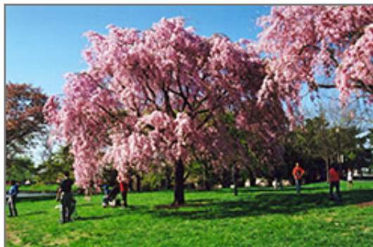
Pink Weeping Higan Cherry in bloom