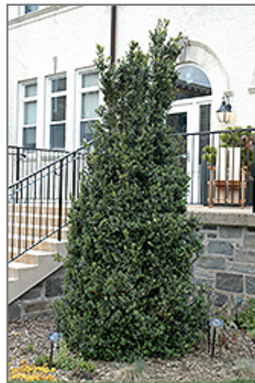
Dee Runk Boxwood

Dee Runk Boxwood will grow to be about 8 feet tall at maturity, with a spread of 24 inches. It tends to fill out right to the ground and therefore doesn't necessarily require facer plants in front, and is suitable for planting under power lines. It grows at a slow rate, and under ideal conditions can be expected to live for 40 years or more.