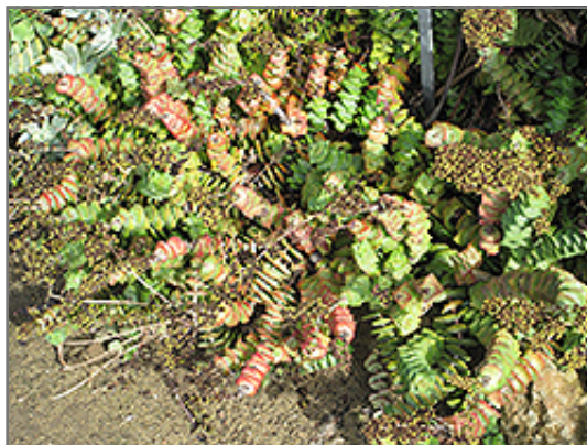
String Of Buttons

String Of Buttons is recommended for the following landscape applications;