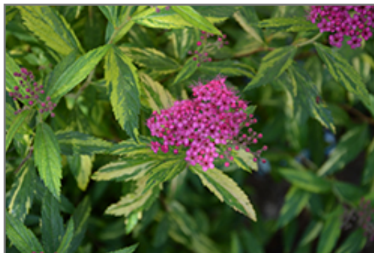
Double Play Painted Lady Spirea flowers