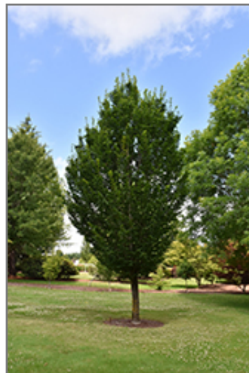
Emerald Avenue Hornbeam