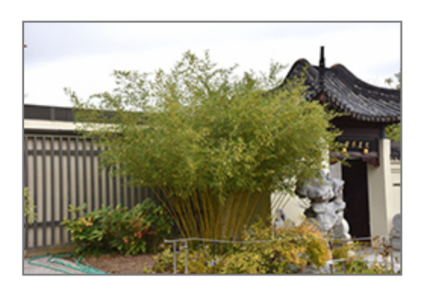
Bisset's Bamboo

Bisset's Bamboo is recommended for the following landscape applications;