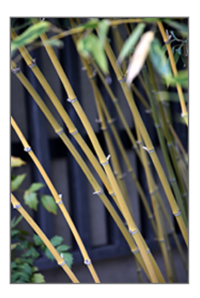
Bisset's Bamboo stems