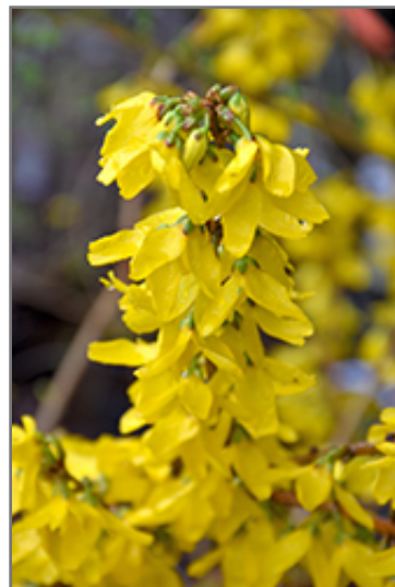
Magical Gold Forsythia flowers

Magical Gold Forsythia makes a fine choice for the outdoor landscape, but it is also well-suited for use in outdoor pots and containers. Because of its height, it is often used as a 'thriller' in the 'spiller-thriller-filler' container combination; plant it near the center of the pot, surrounded by smaller plants and those that spill over the edges. It is even sizeable enough that it can be grown alone in a suitable container. Note that when grown in a container, it may not perform exactly as indicated on the tag - this is to be expected. Also note that when growing plants in outdoor containers and baskets, they may require more frequent waterings than they would in the yard or garden.