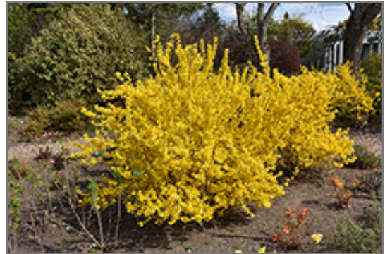
Magical Gold Forsythia in bloom