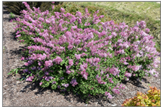
Bloomerang Dwarf Pink Lilac in bloom

Bloomerang Dwarf Pink Lilac will grow to be about 30 inches tall at maturity, with a spread of 3 feet. When grown in masses or used as a bedding plant, individual plants should be spaced approximately 30 inches apart. It tends to fill out right to the ground and therefore doesn't necessarily require facer plants in front. It grows at a slow rate, and under ideal conditions can be expected to live for approximately 30 years.