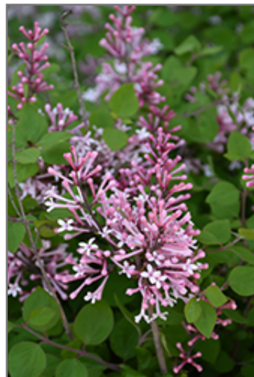
Bloomerang Dwarf Pink Lilac flowers

Bloomerang Dwarf Pink Lilac is recommended for the following landscape applications;