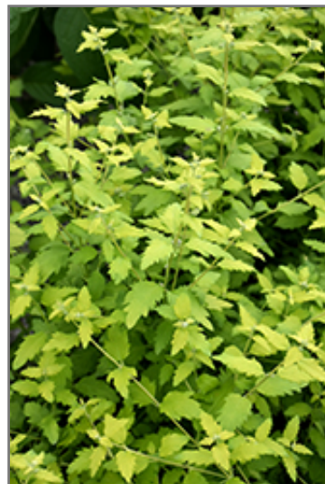
Sunshine Blue II Caryopteris foliage

Sunshine Blue II Caryopteris makes a fine choice for the outdoor landscape, but it is also well-suited for use in outdoor pots and containers. With its upright habit of growth, it is best suited for use as a 'thriller' in the 'spiller-thriller-filler' container combination; plant it near the center of the pot, surrounded by smaller plants and those that spill over the edges. It is even sizeable enough that it can be grown alone in a suitable container. Note that when grown in a container, it may not perform exactly as indicated on the tag - this is to be expected. Also note that when growing plants in outdoor containers and baskets, they may require more frequent waterings than they would in the yard or garden.