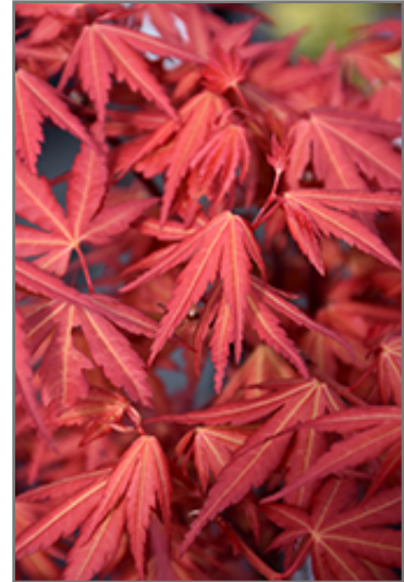
First Flame Maple foliage