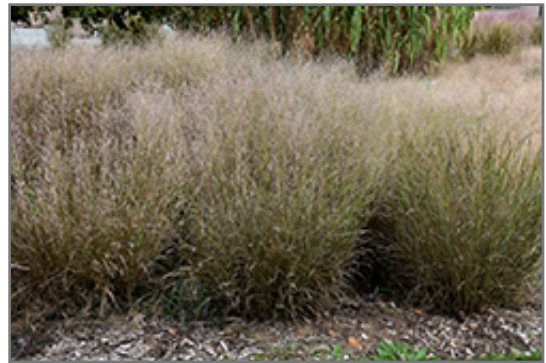
Shenandoah Reed Switch Grass fruit