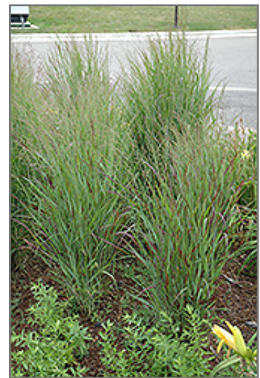
Shenandoah Reed Switch Grass