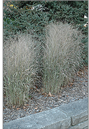
Shenandoah Reed Switch Grass in fall

This plant does best in full sun to partial shade. It is very adaptable to both dry and moist locations, and should do just fine under typical garden conditions. It is considered to be drought-tolerant, and thus makes an ideal choice for a low-water garden or xeriscape application. It is not particular as to soil type, but has a definite preference for alkaline soils, and is able to handle environmental salt. It is somewhat tolerant of urban pollution. This is a selection of a native North American species. It can be propagated by division; however, as a cultivated variety, be aware that it may be subject to certain restrictions or prohibitions on propagation.