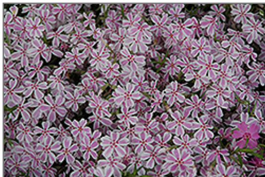
Candy Stripe Moss Phlox flowers

Candy Stripe Moss Phlox is smothered in stunning pink star-shaped flowers with crimson eyes and white stripes at the ends of the stems from early to late spring. Its tiny needle-like leaves remain forest green in color throughout the year.