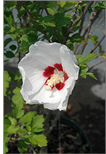
Red Heart Rose Of Sharon flowers

Red Heart Rose Of Sharon is recommended for the following landscape applications;