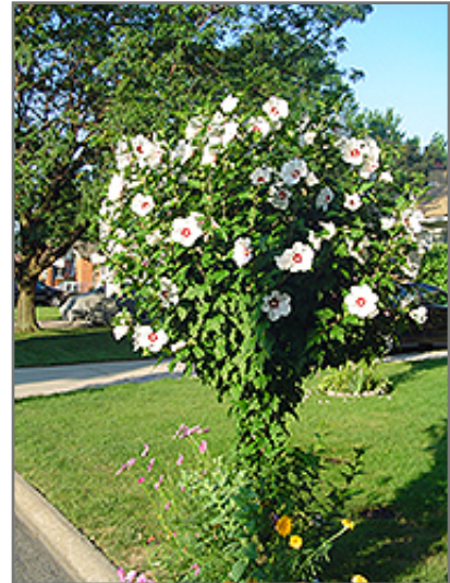
Red Heart Rose Of Sharon in bloom