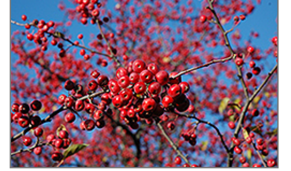
Prairie Crab Apple fruit