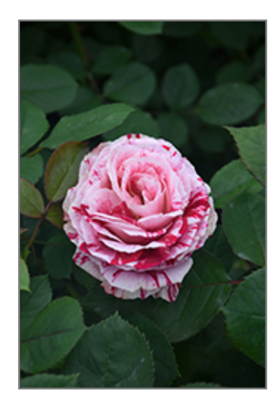
Scentimental Rose flowers