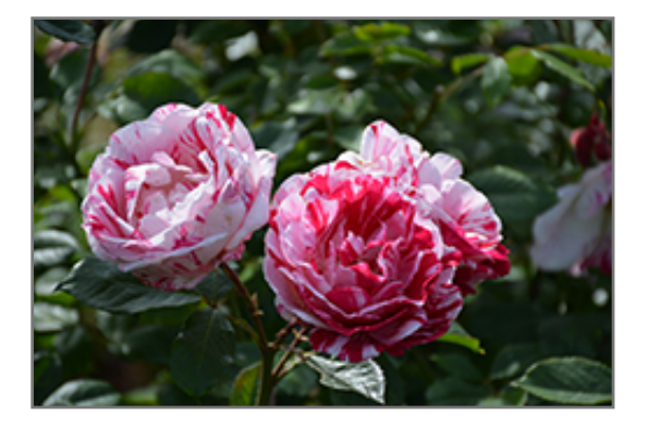
Scentimental Rose flowers

Scentimental Rose is recommended for the following landscape applications;