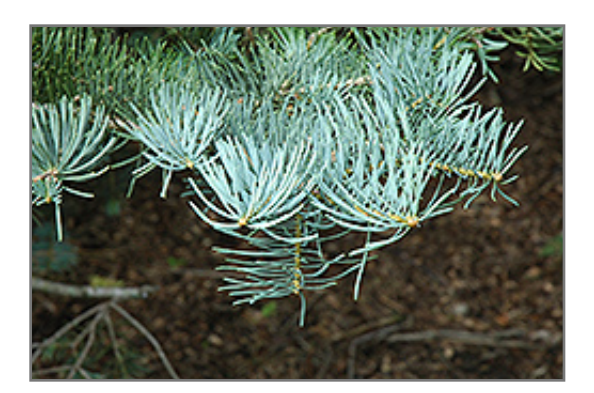
White Fir foliage