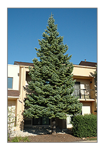
White Fir