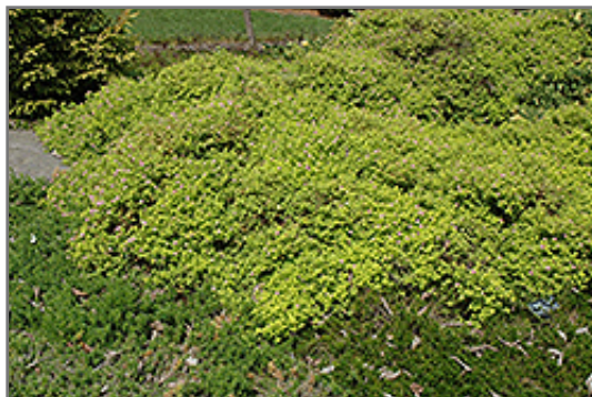
Golden Elf Spirea

Golden Elf Spirea is recommended for the following landscape applications;