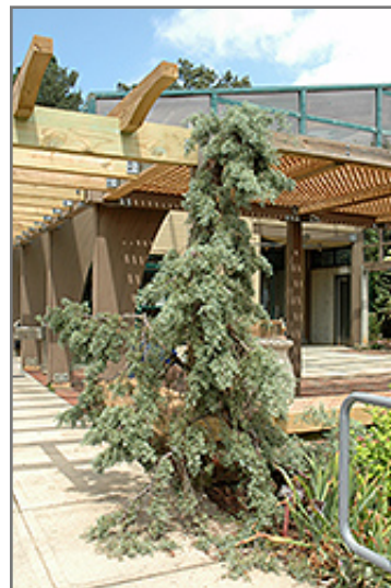
Raywood's Weeping Arizona Cypress