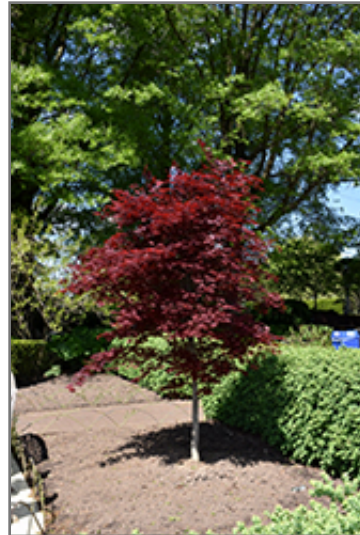
Fireglow Japanese Maple