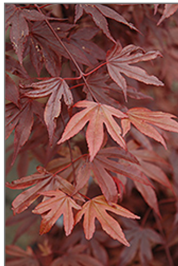
Fireglow Japanese Maple foliage