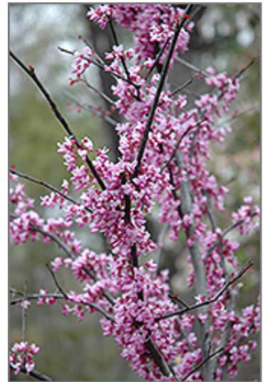
Forest Pansy Redbud flowers