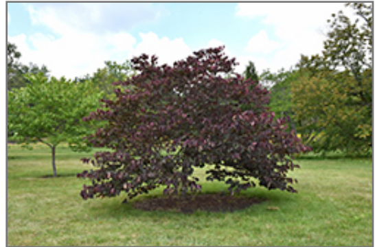
Forest Pansy Redbud