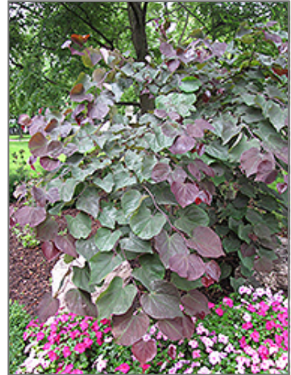
Forest Pansy Redbud foliage

This tree does best in full sun to partial shade. It prefers to grow in average to moist conditions, and shouldn't be allowed to dry out. It is not particular as to soil type or pH. It is highly tolerant of urban pollution and will even thrive in inner city environments, and will benefit from being planted in a relatively sheltered location. Consider applying a thick mulch around the root zone in winter to protect it in exposed locations or colder microclimates. This is a selection of a native North American species.