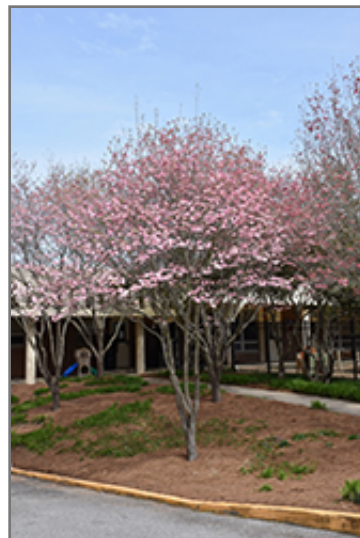
Prairie Pink Flowering Dogwood in bloom