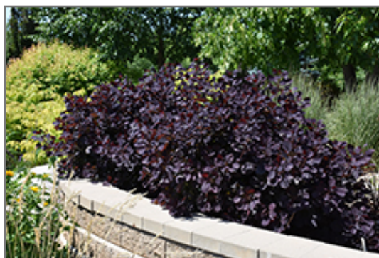
Royal Purple Smokebush