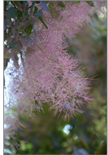
Royal Purple Smokebush flowers

This shrub should only be grown in full sunlight. It is very adaptable to both dry and moist locations, and should do just fine under average home landscape conditions. It is not particular as to soil type or pH. It is highly tolerant of urban pollution and will even thrive in inner city environments, and will benefit from being planted in a relatively sheltered location. This is a selected variety of a species not originally from North America.