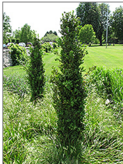
Graham Blandy Boxwood