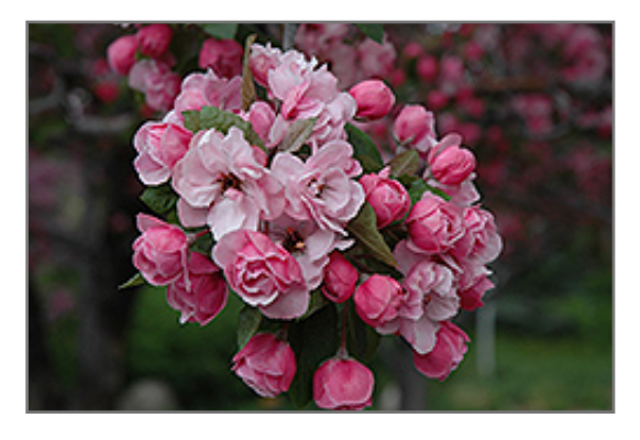
Brandywine Flowering Crab flowers