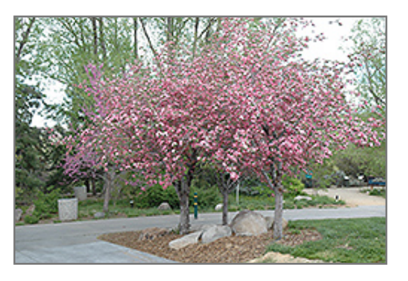
Brandywine Flowering Crab in bloom