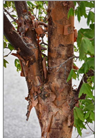
Paperbark Maple bark