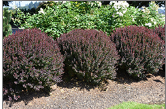
Pygmy Ruby Barberry