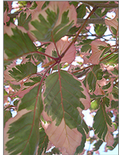
Tricolor Beech foliage