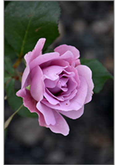
Angel Face Rose flowers