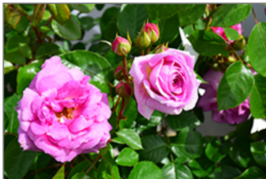
Angel Face Rose flowers

This shrub does best in full sun to partial shade. It does best in average to evenly moist conditions, but will not tolerate standing water. It is not particular as to soil type or pH. It is highly tolerant of urban pollution and will even thrive in inner city environments. This particular variety is an interspecific hybrid.