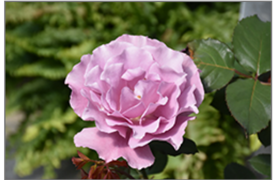
Angel Face Rose flowers