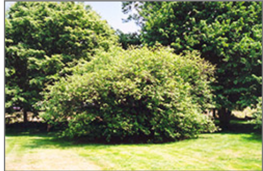
American Hazelnut

This plant is typically grown in a designated edibles garden. It performs well in both full sun and full shade. It is very adaptable to both dry and moist locations, and should do just fine under average home landscape conditions. It is considered to be drought-tolerant, and thus makes an ideal choice for xeriscaping or the moisture-conserving landscape. It is not particular as to soil type or pH. It is highly tolerant of urban pollution and will even thrive in inner city environments. This species is native to parts of North America.