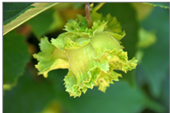
American Hazelnut fruit