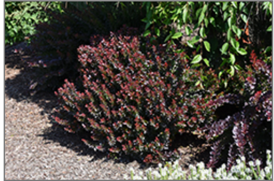
Midnight Ruby Barberry

This shrub does best in full sun to partial shade. It is very adaptable to both dry and moist growing conditions, but will not tolerate any standing water. It is considered to be drought-tolerant, and thus makes an ideal choice for a low-water garden or xeriscape application. It is not particular as to soil type or pH, and is able to handle environmental salt. It is highly tolerant of urban pollution and will even thrive in inner city environments. This is a selected variety of a species not originally from North America.