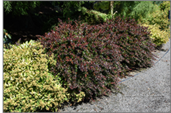
Midnight Ruby Barberry