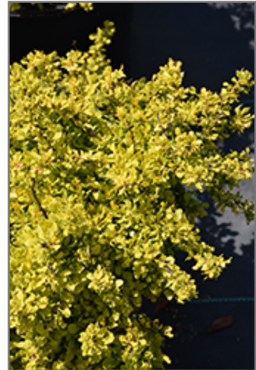
Tiny Gold Barberry foliage