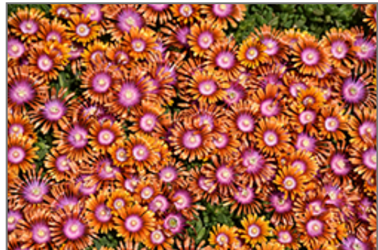
Fire Spinner Ice Plant in bloom

Fire Spinner Ice Plant is recommended for the following landscape applications;