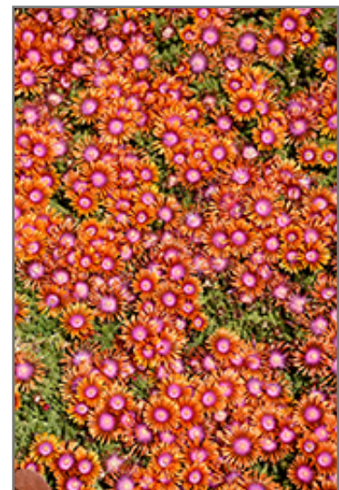
Fire Spinner Ice Plant flowers