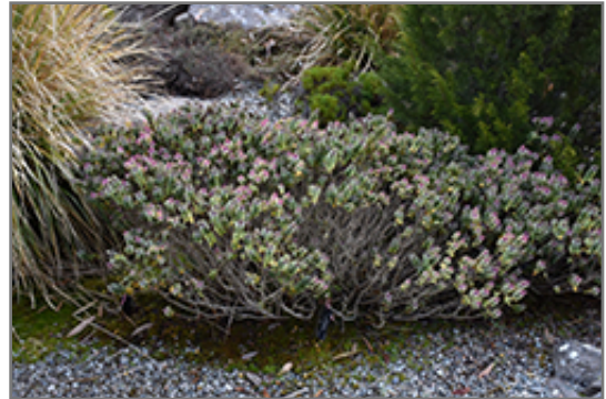
Silver Dollar Hebe