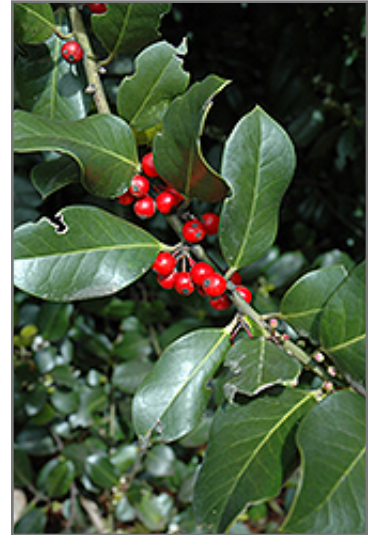
Hendersonii Holly fruit