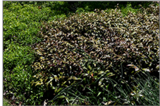
Scarletta Fetterbush