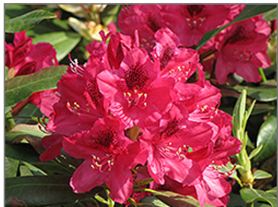
Nova Zembla Rhododendron flowers