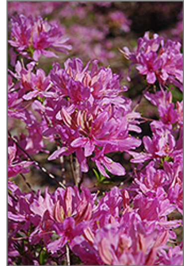
Orchid Lights Azalea flowers