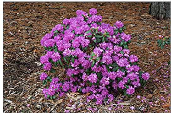
Compact P.J.M. Rhododendron in bloom