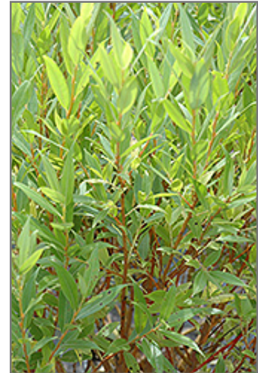
Flame Willow foliage