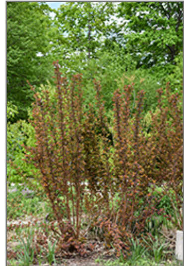
Mahogany Magic Ninebark