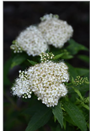
Japanese White Spirea flowers

Japanese White Spirea is recommended for the following landscape applications;