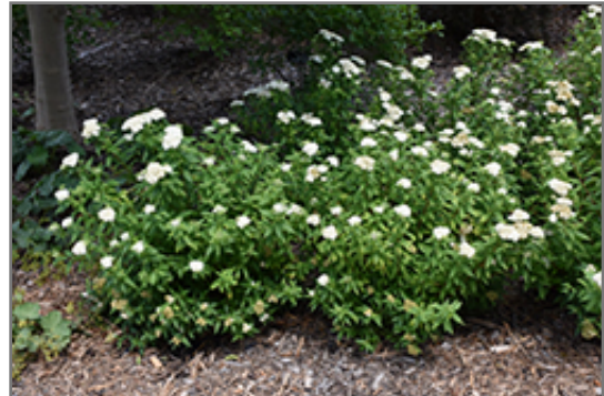
Japanese White Spirea in bloom