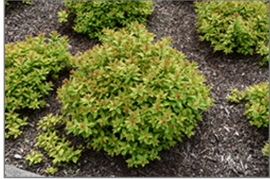
Dakota Goldcharm Spirea

This shrub should only be grown in full sunlight. It prefers to grow in average to moist conditions, and shouldn't be allowed to dry out. It is not particular as to soil type or pH. It is highly tolerant of urban pollution and will even thrive in inner city environments. This is a selected variety of a species not originally from North America.