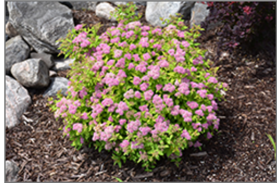
Dakota Goldcharm Spirea in bloom

Dakota Goldcharm Spirea is recommended for the following landscape applications;