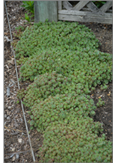
Lime Zinger Stonecrop

Lime Zinger Stonecrop will grow to be only 4 inches tall at maturity extending to 6 inches tall with the flowers, with a spread of 18 inches. When grown in masses or used as a bedding plant, individual plants should be spaced approximately 15 inches apart. Its foliage tends to remain low and dense right to the ground. It grows at a fast rate, and under ideal conditions can be expected to live for approximately 15 years. As an herbaceous perennial, this plant will usually die back to the crown each winter, and will regrow from the base each spring. Be careful not to disturb the crown in late winter when it may not be readily seen!