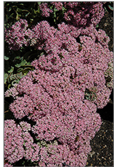
Lime Zinger Stonecrop flowers

This is a relatively low maintenance plant, and is best cleaned up in early spring before it resumes active growth for the season. It is a good choice for attracting bees and butterflies to your yard, but is not particularly attractive to deer who tend to leave it alone in favor of tastier treats. It has no significant negative characteristics.