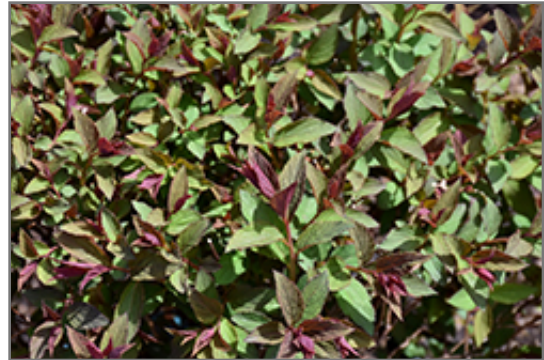
Double Play Artisan Spirea foliage